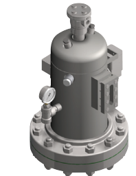
AES-FV™ available: This Flanged Vessel can be split to administer efficient cleaning.

Barrier & buffer fluid systems for use with double mechanical seals. AESSEAL® supplies an extensive range of barrier and buffer fluid systems for use with double mechanical seals. Wherever possible AESSEAL® prefers to supply both the seal and the system. In addition the company will suggest suitable barrier or buffer fluids for most applications, based on extensive field experience. AESSEAL® accepts no responsibility for any problems associated with system design, installation, operation, or the use of an unsuitable barrier or buffer fluid, where the fluid, seal or any part of the system have not been specified and / or supplied by AESSEAL®